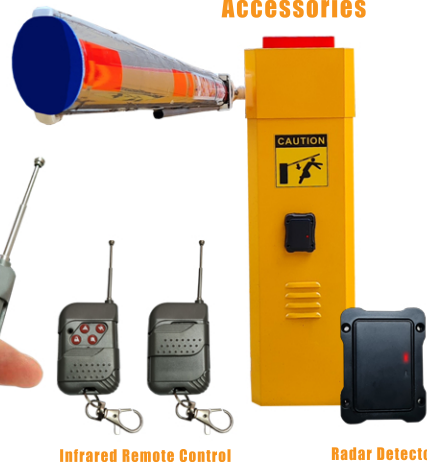
Infrared Remote Control